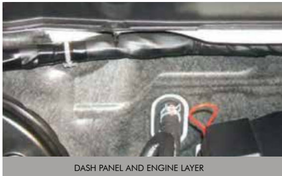
DASH PANEL AND ENGINE LAYER