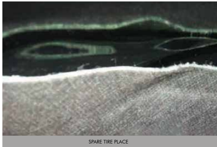
SPARE TIRE PLACE