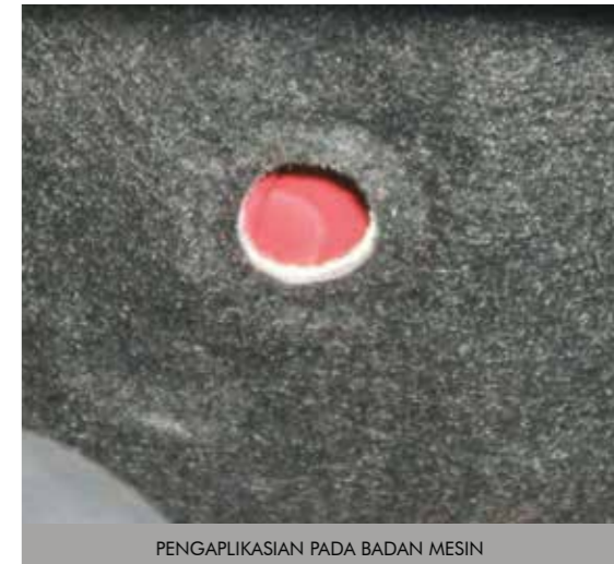
PENGAPLIKASIAN PADA BADAN MESIN