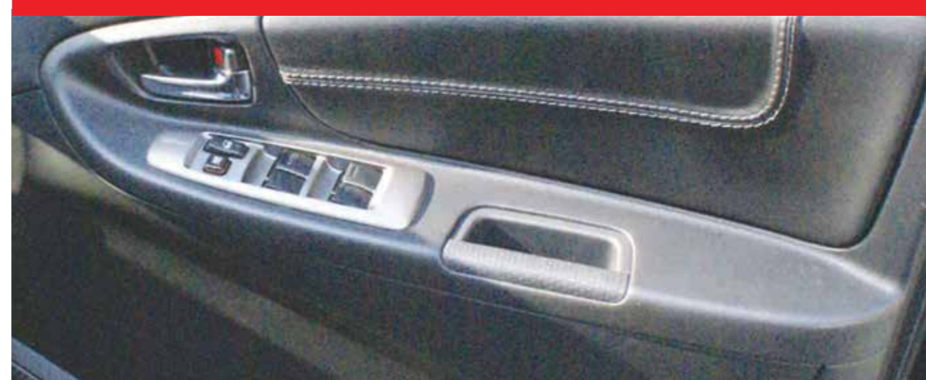
APPLICATIONS ON THE DOOR AS INSULATING (DOOR TRIM)